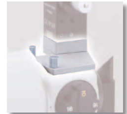
Tonometer Mount for R870 (SO-TM2)