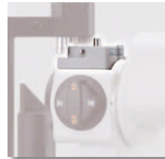
Tonometer Mount for R900 (SO-TM1)