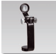
Fundus Viewer FV-IL